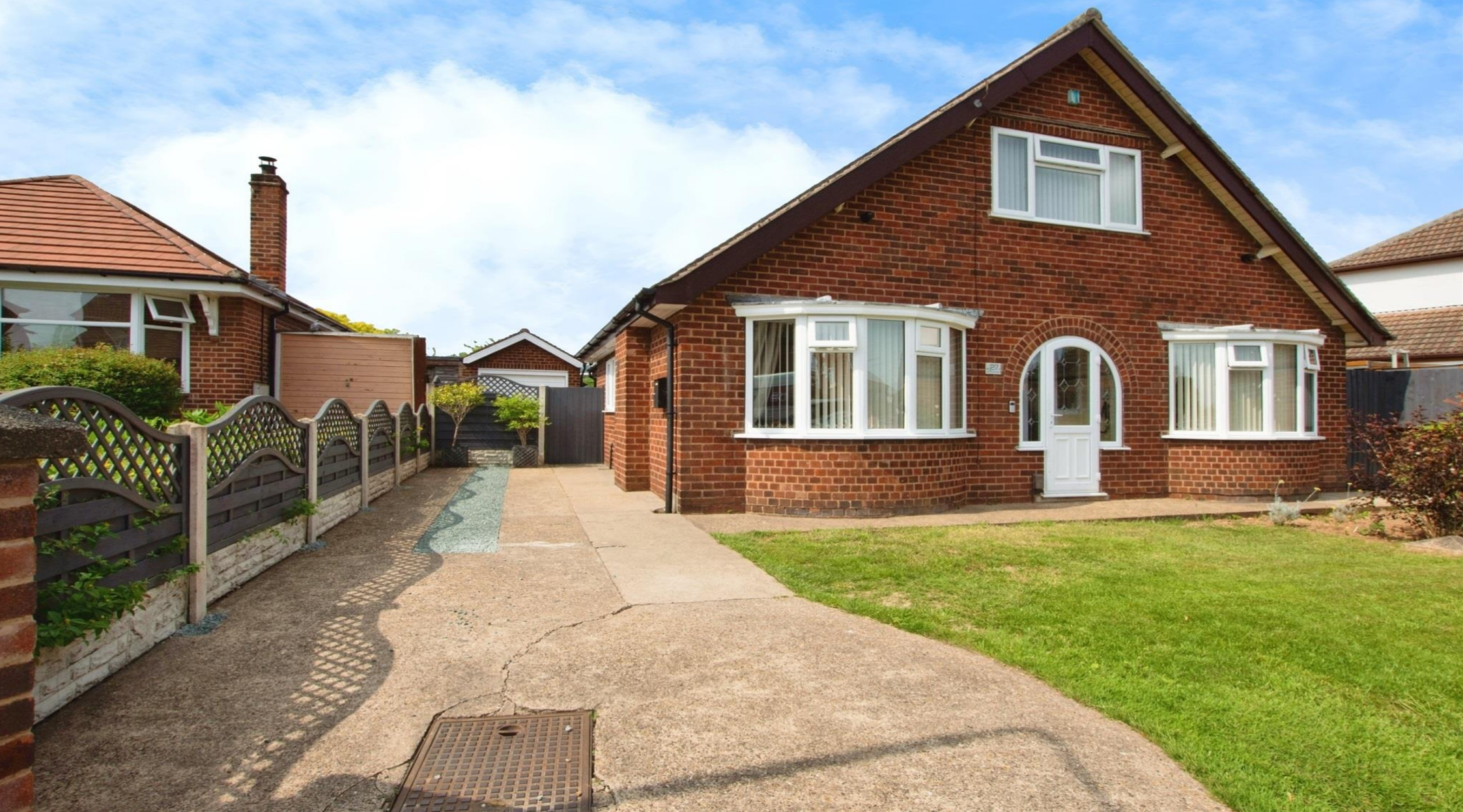
Melbourne Street Mansfield Woodhouse Mansfield