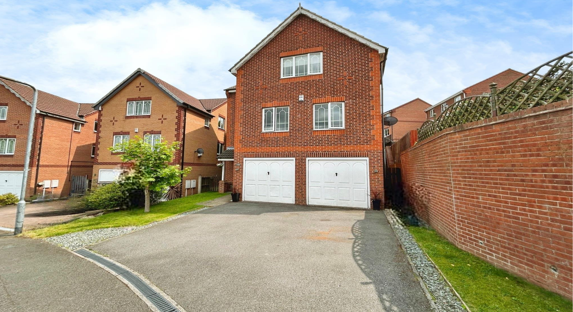
Hambleton Rise Forest Town Mansfield