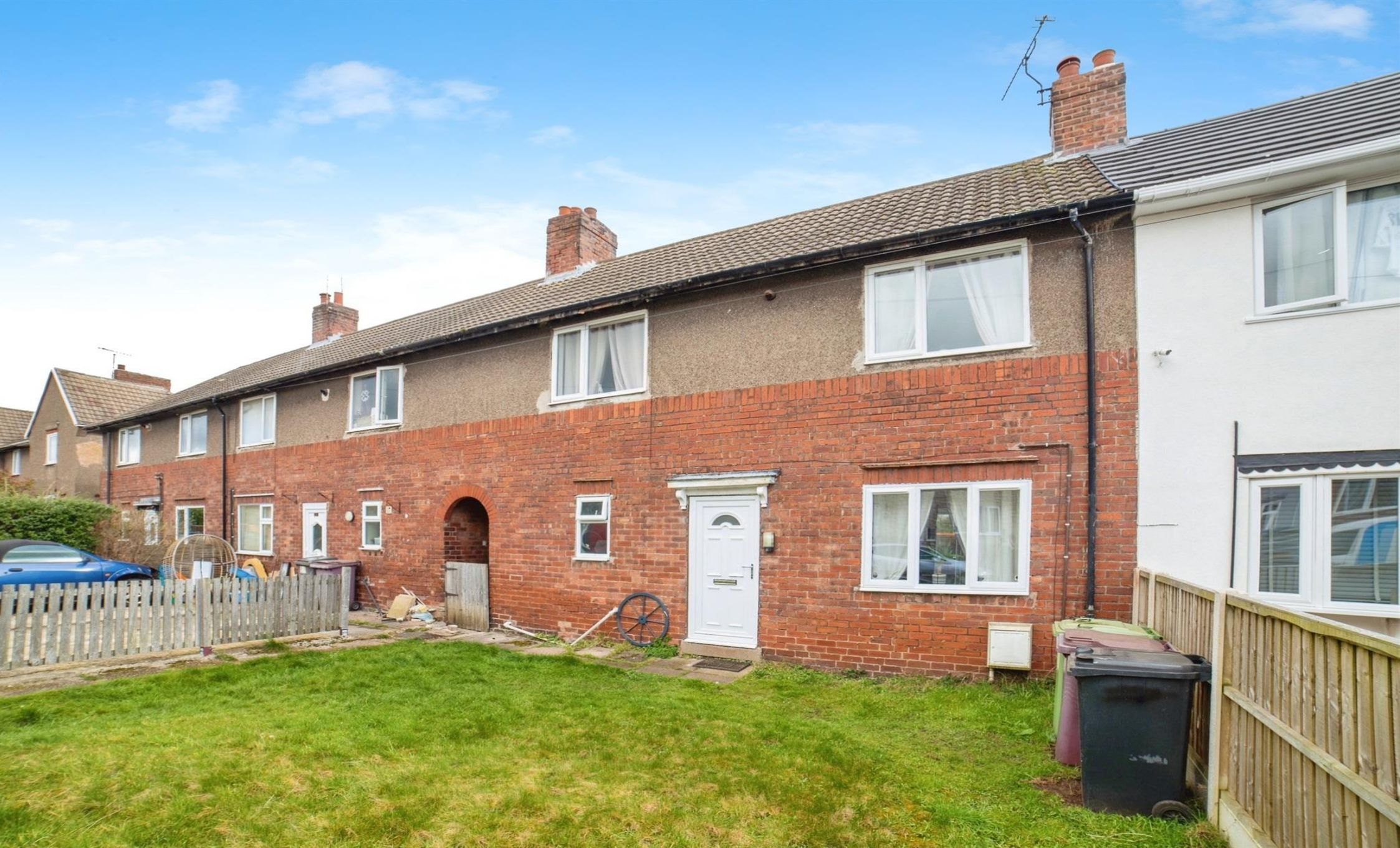
Hartington Street Langwith Mansfield