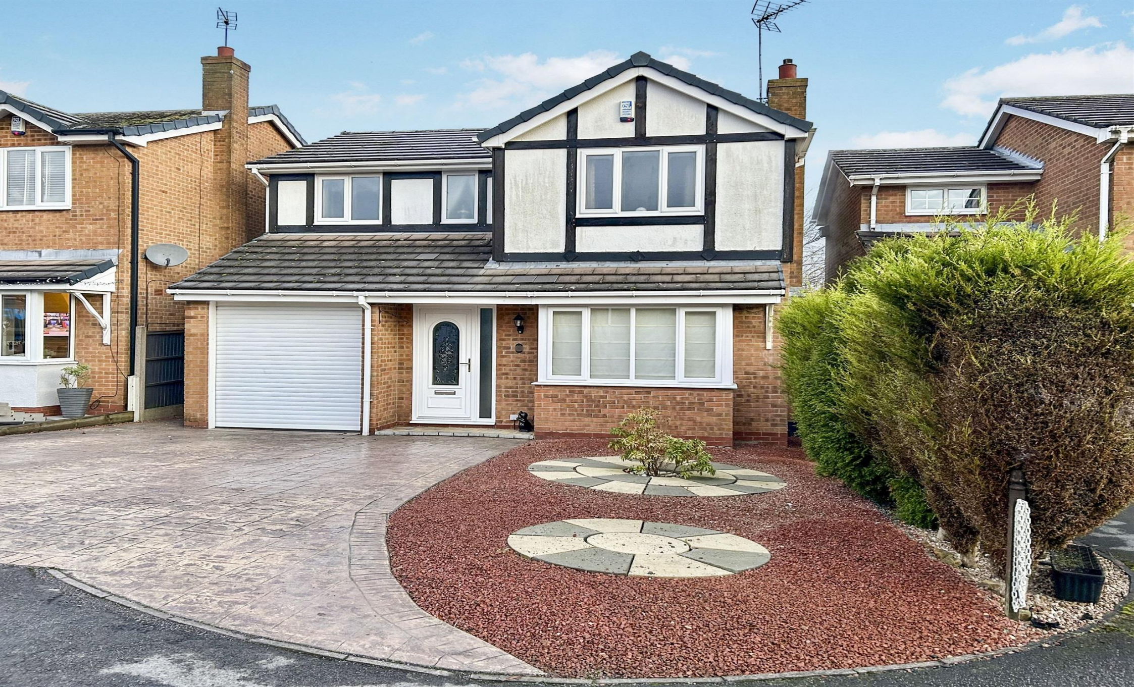
Bluebell Grove Kirkby-In-Ashfield Nottingham