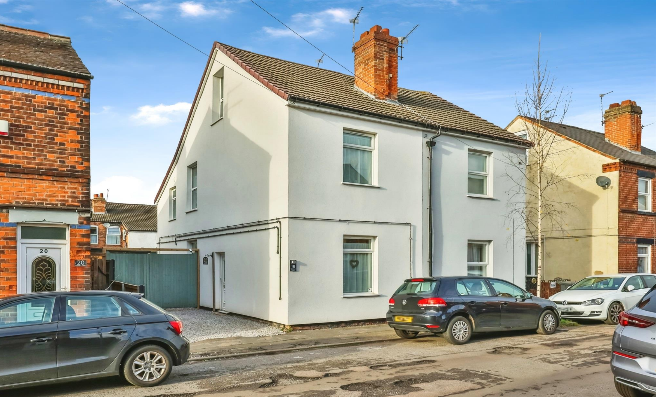
Godfrey Street Netherfield Nottingham