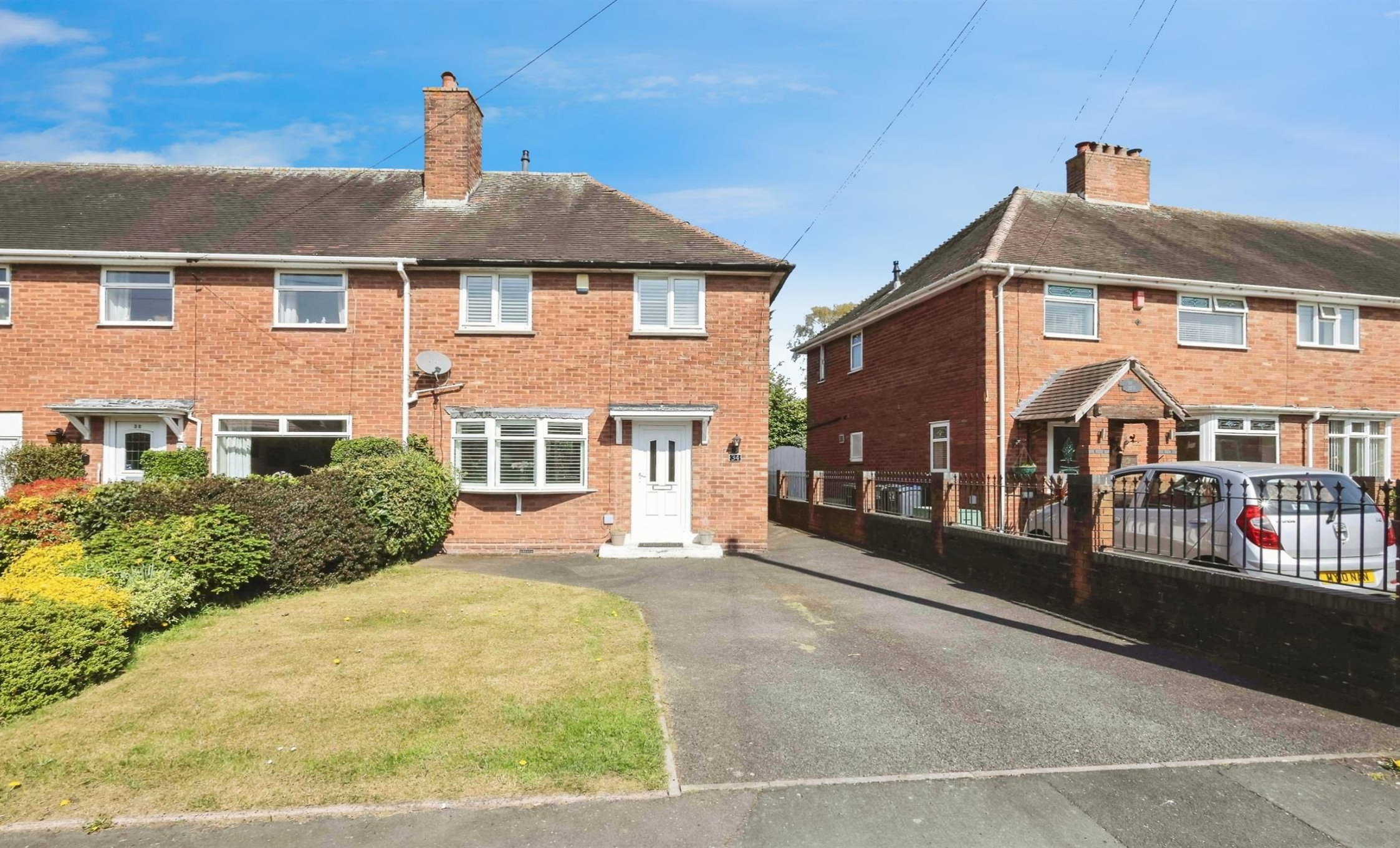
Gibbons Road, Sutton Coldfield