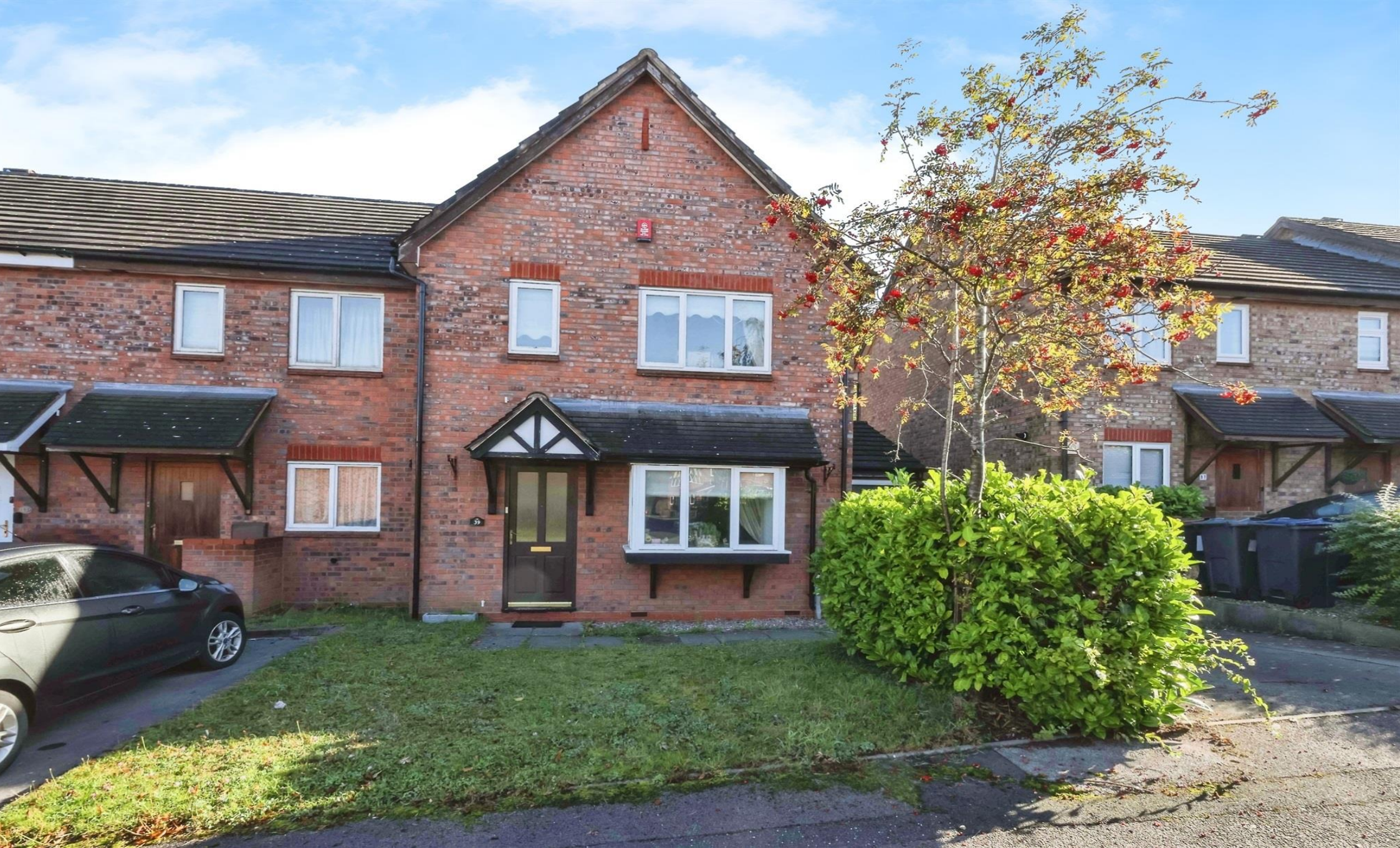
The Limes, Erdington Birmingham