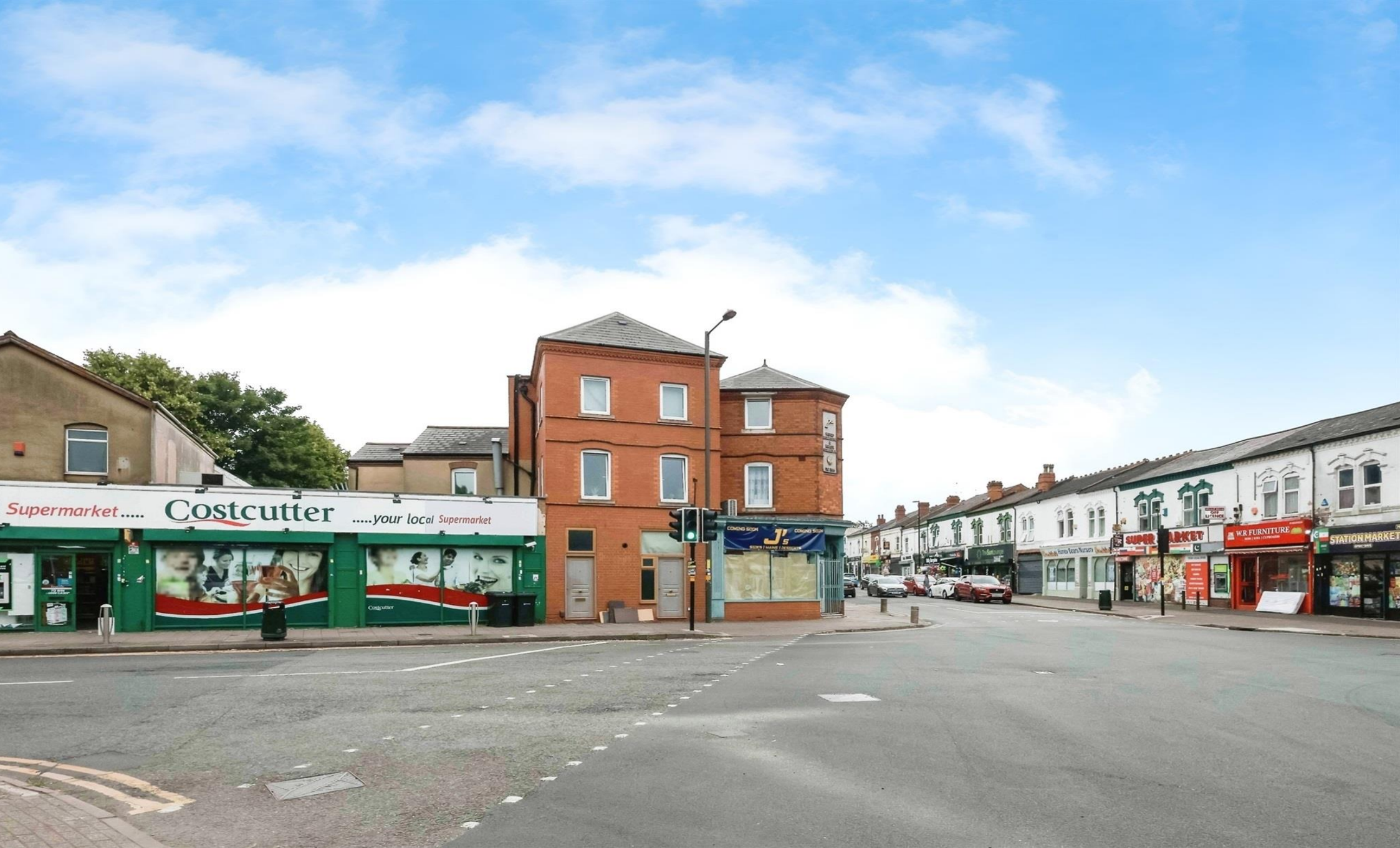
Gravelly Lane, Birmingham