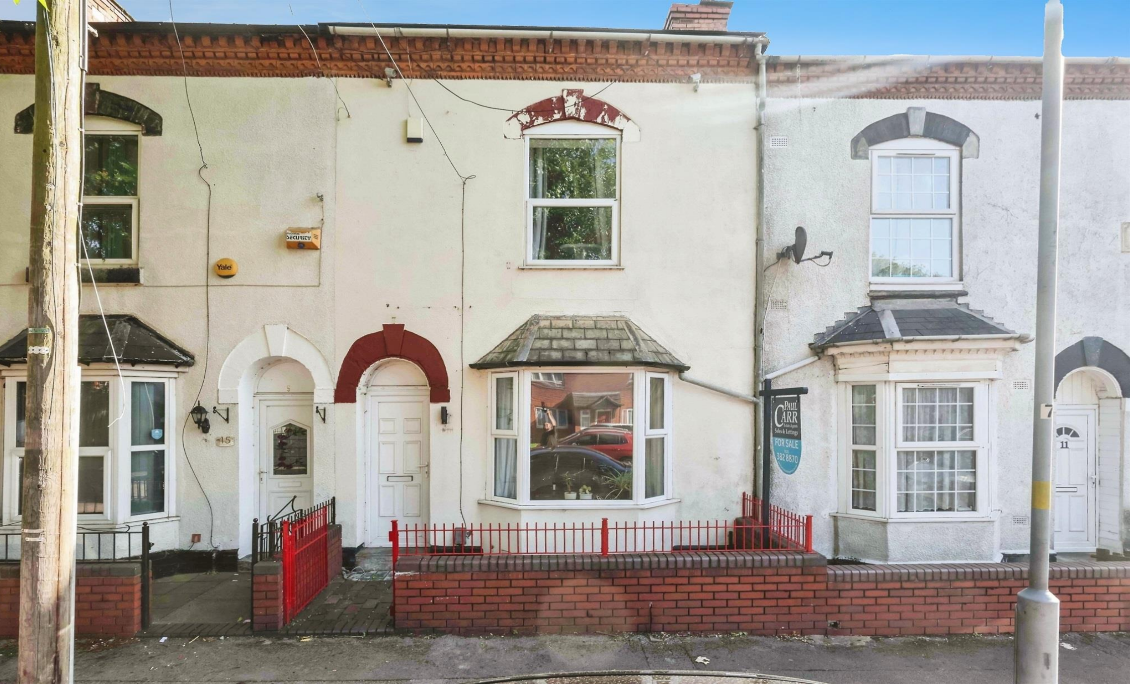
Crompton Road, Nechells Birmingham