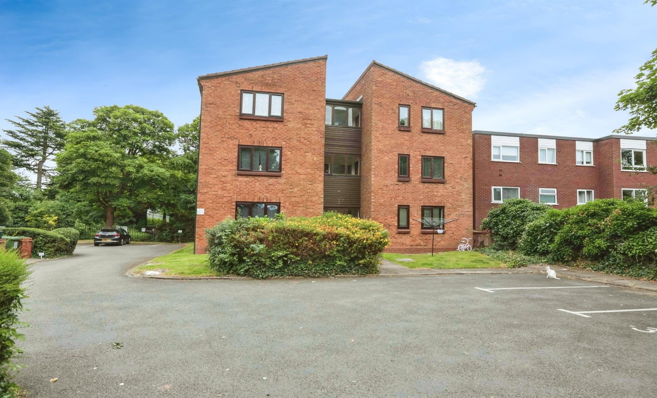
Knights Close, Birmingham