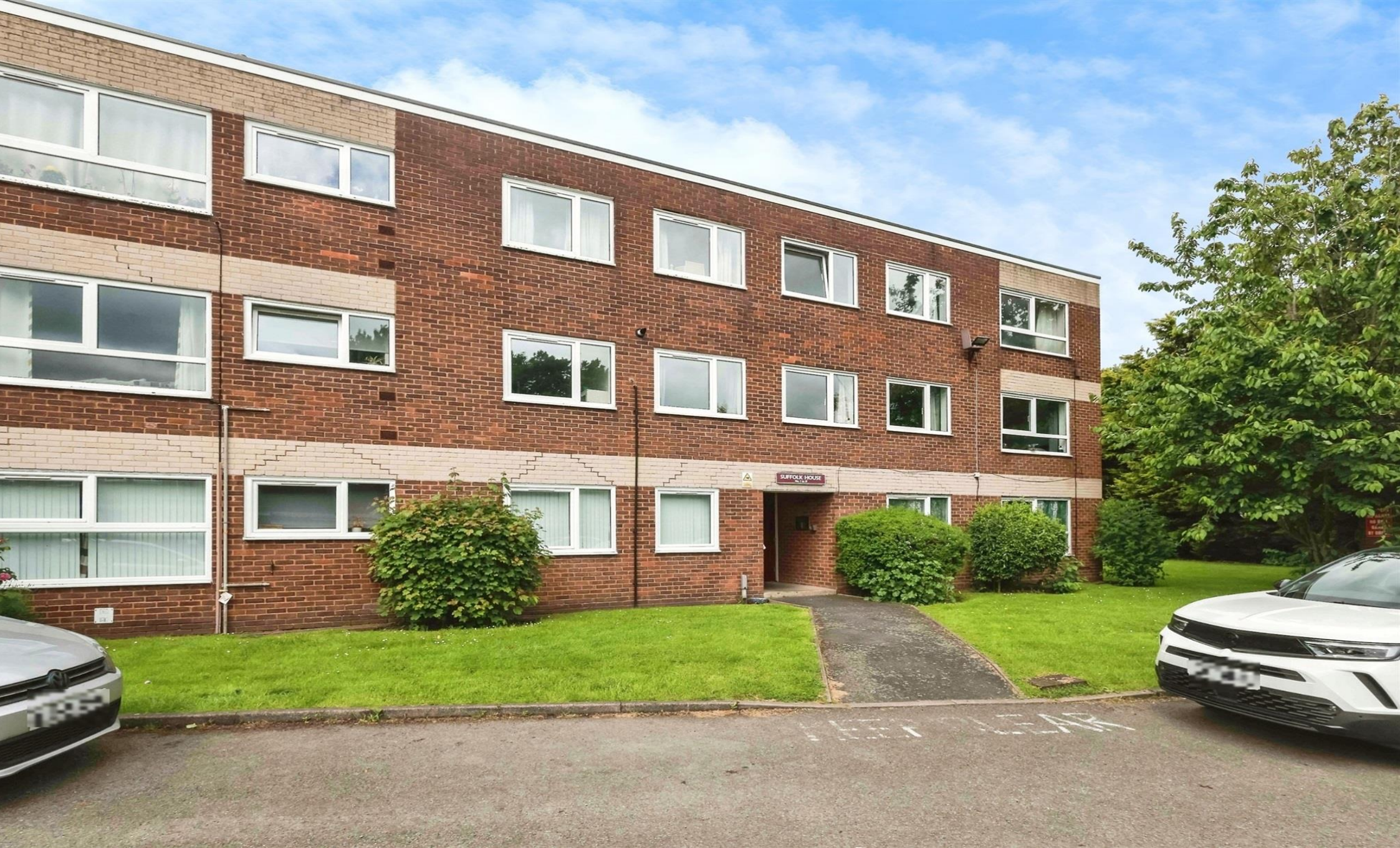
Suffolk House Westland Close, BIRMINGHAM