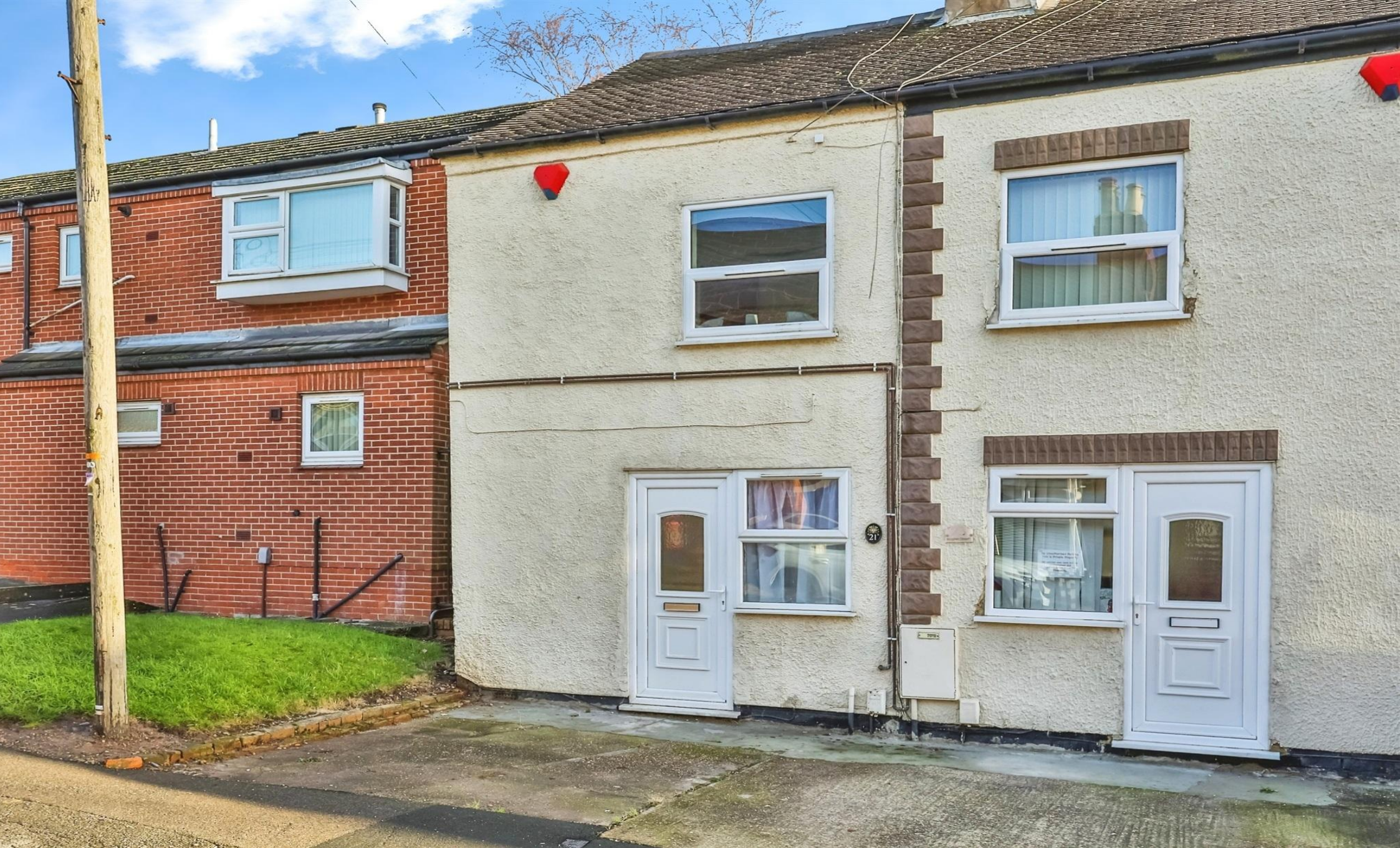
Raglan Street Eastwood Nottingham