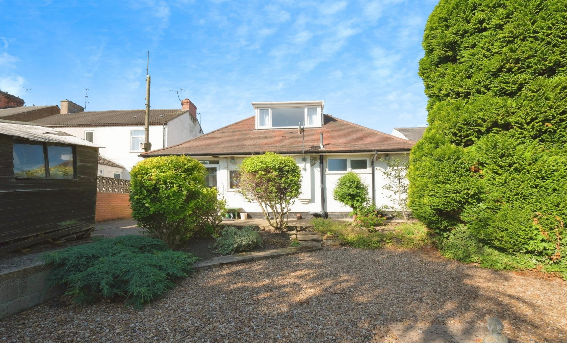
Lynncroft Eastwood Nottingham