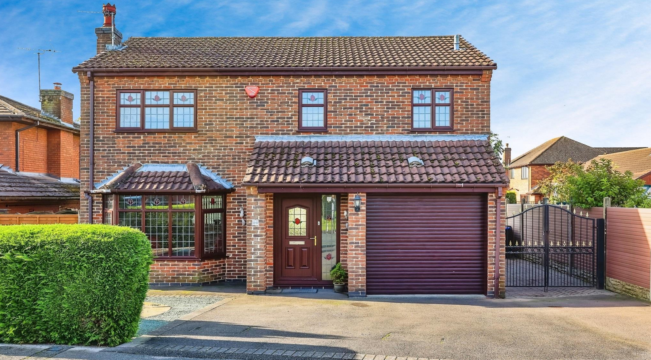
Sharrard Close Underwood Nottingham