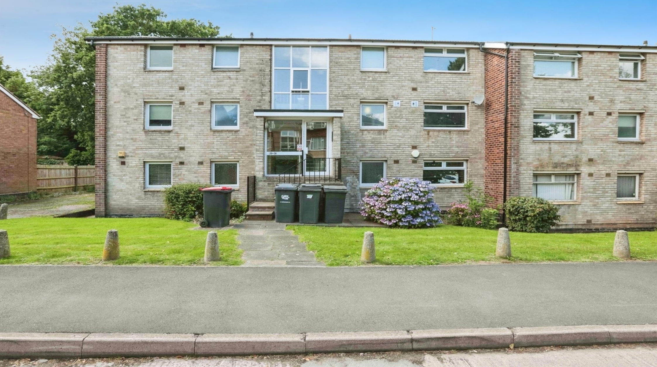
Orton Close, Water Orton, Birmingham