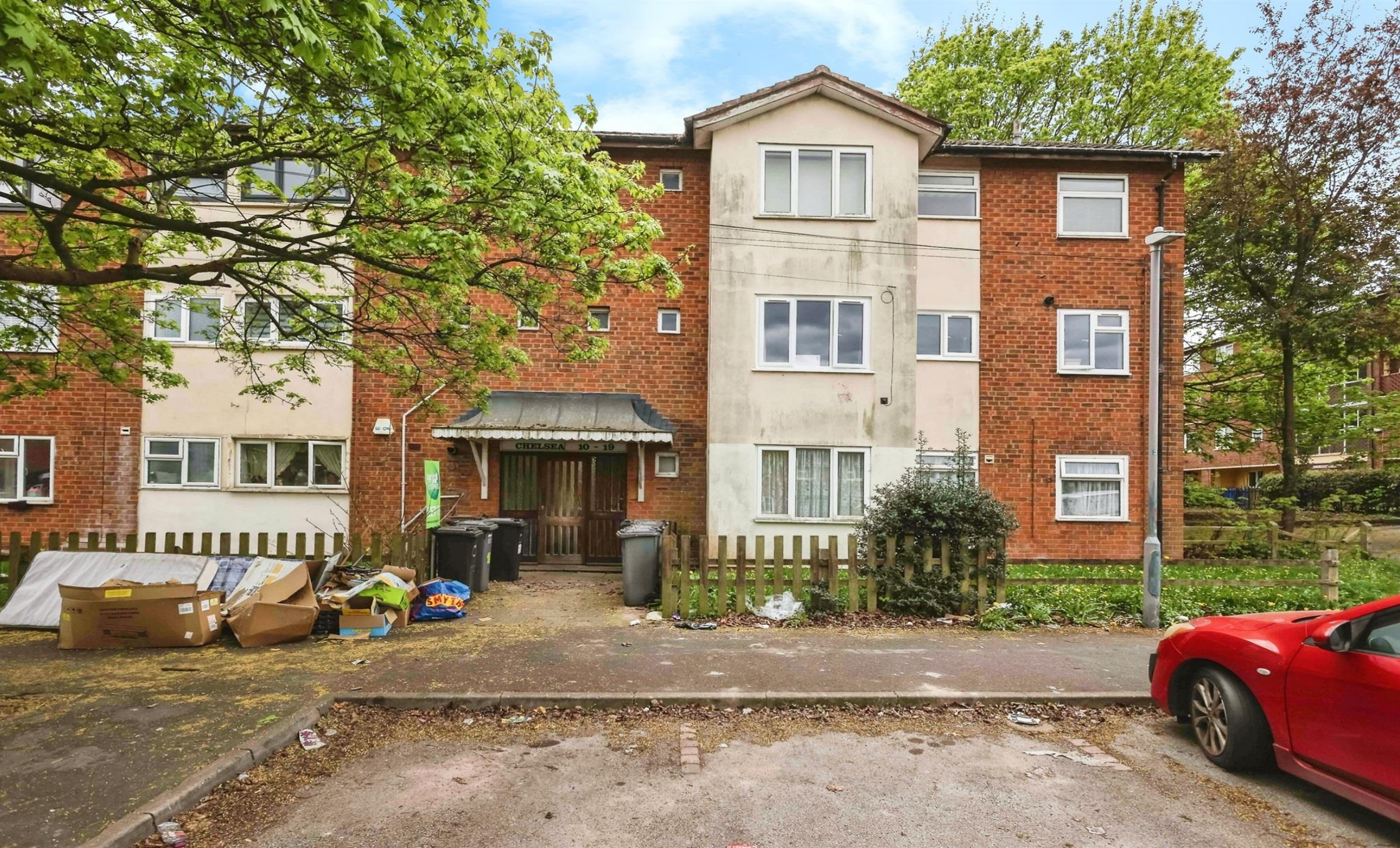
Chelsea Chilvers Grove, Birmingham