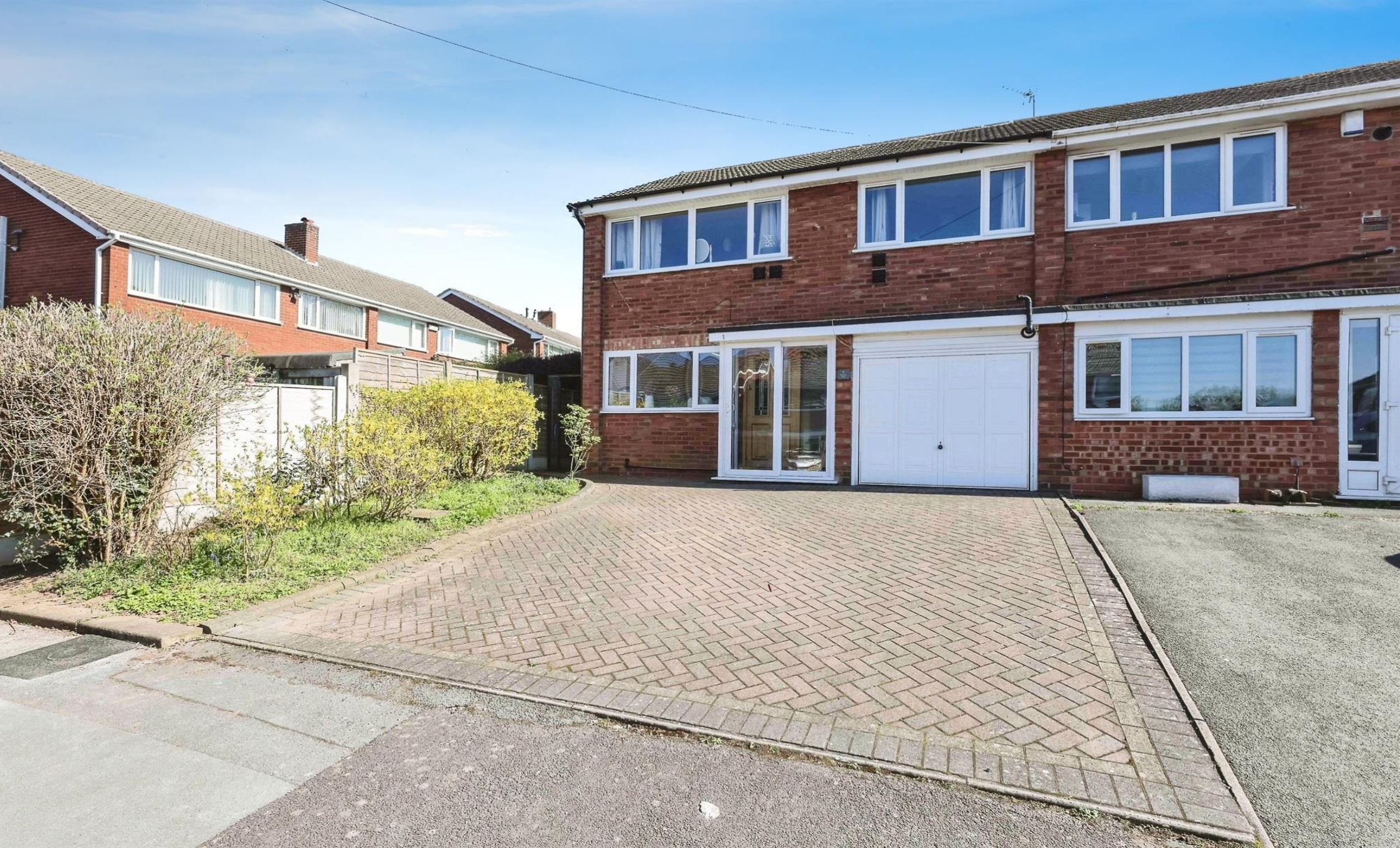
Martin Rise, Birmingham