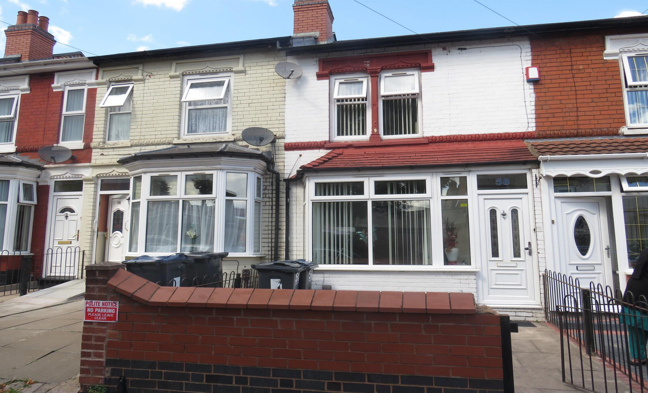
Hazelbeach Road, Birmingham