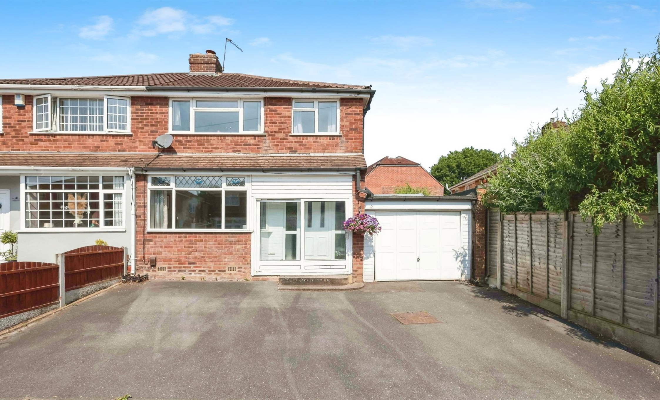
Mowe Croft, Birmingham