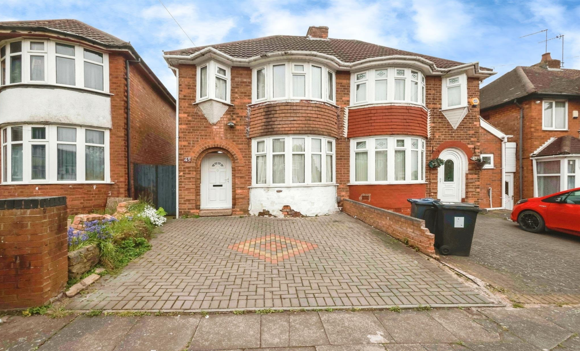
Haycroft Avenue, Birmingham