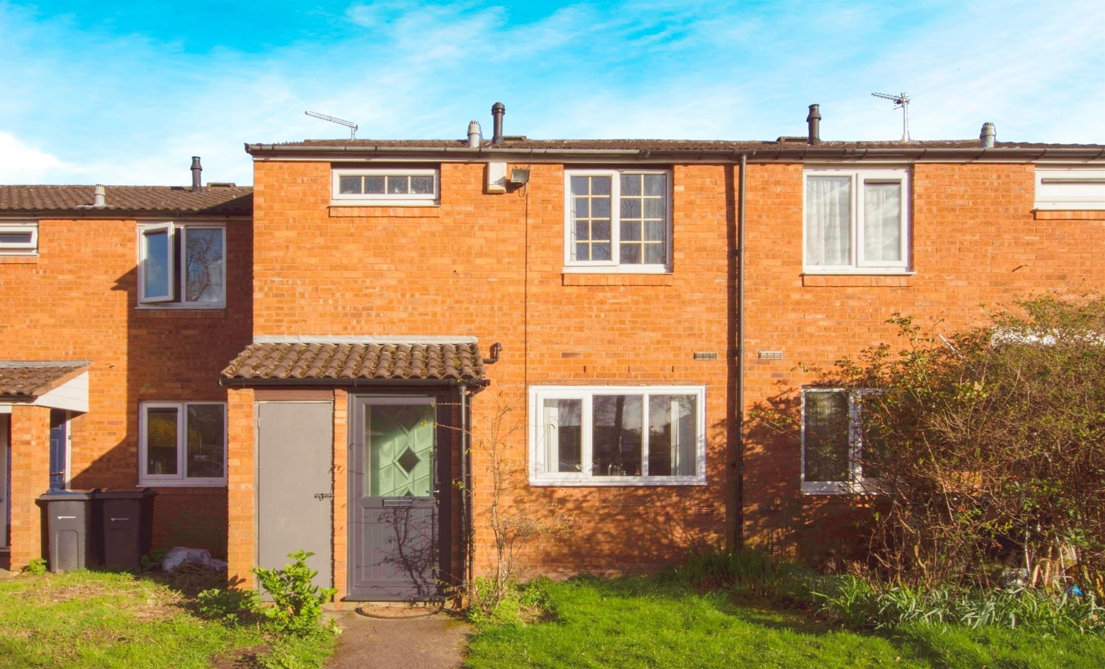
The Corngreaves, Birmingham