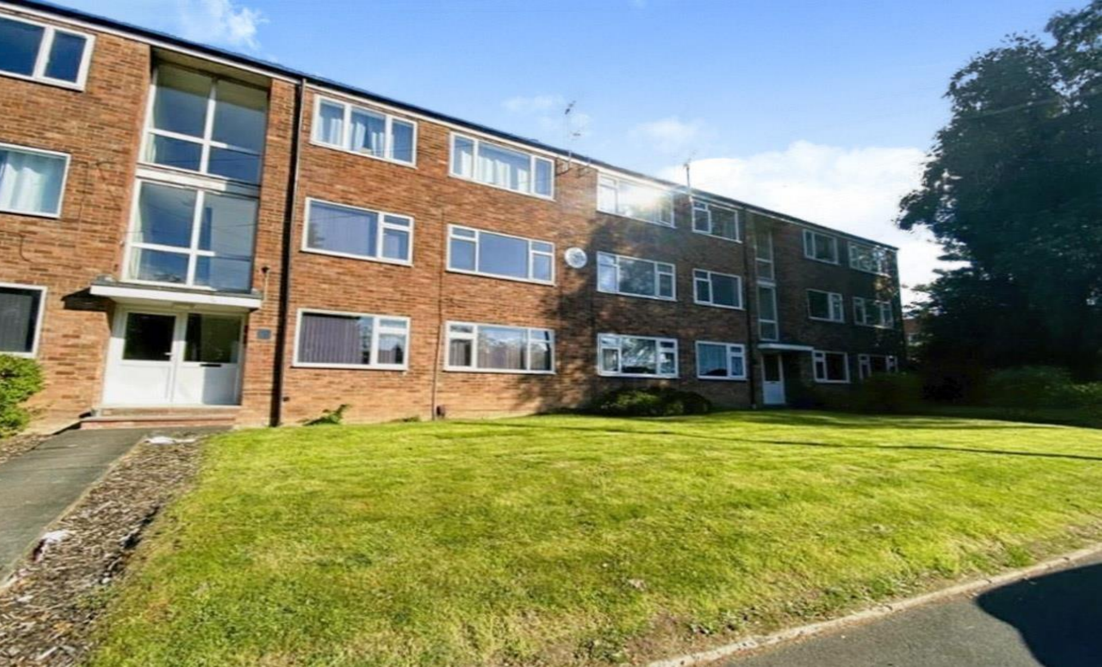
Simon Court Exhall Coventry