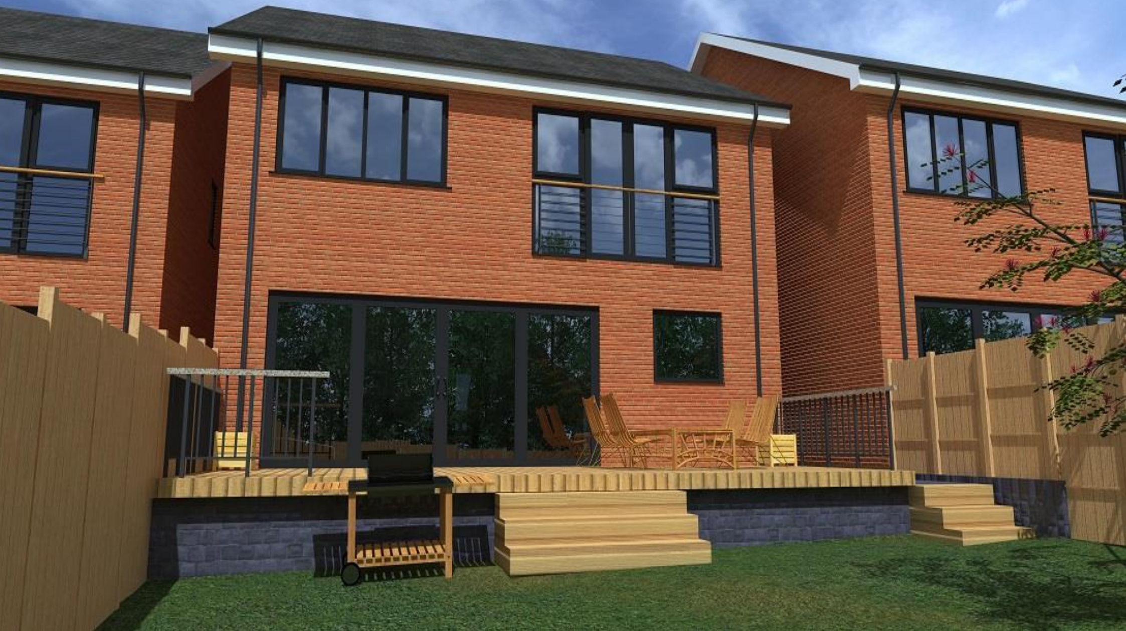
Pineview, Coton Park Linton Swadlincote