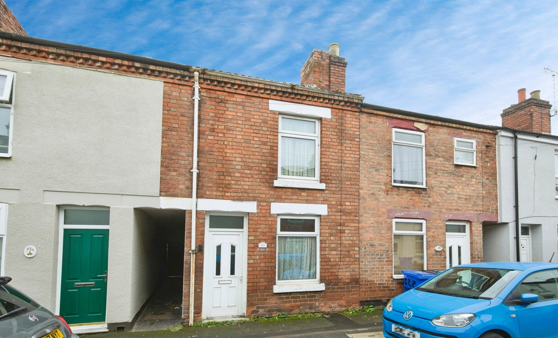
Stafford Street, Burton-On-Trent