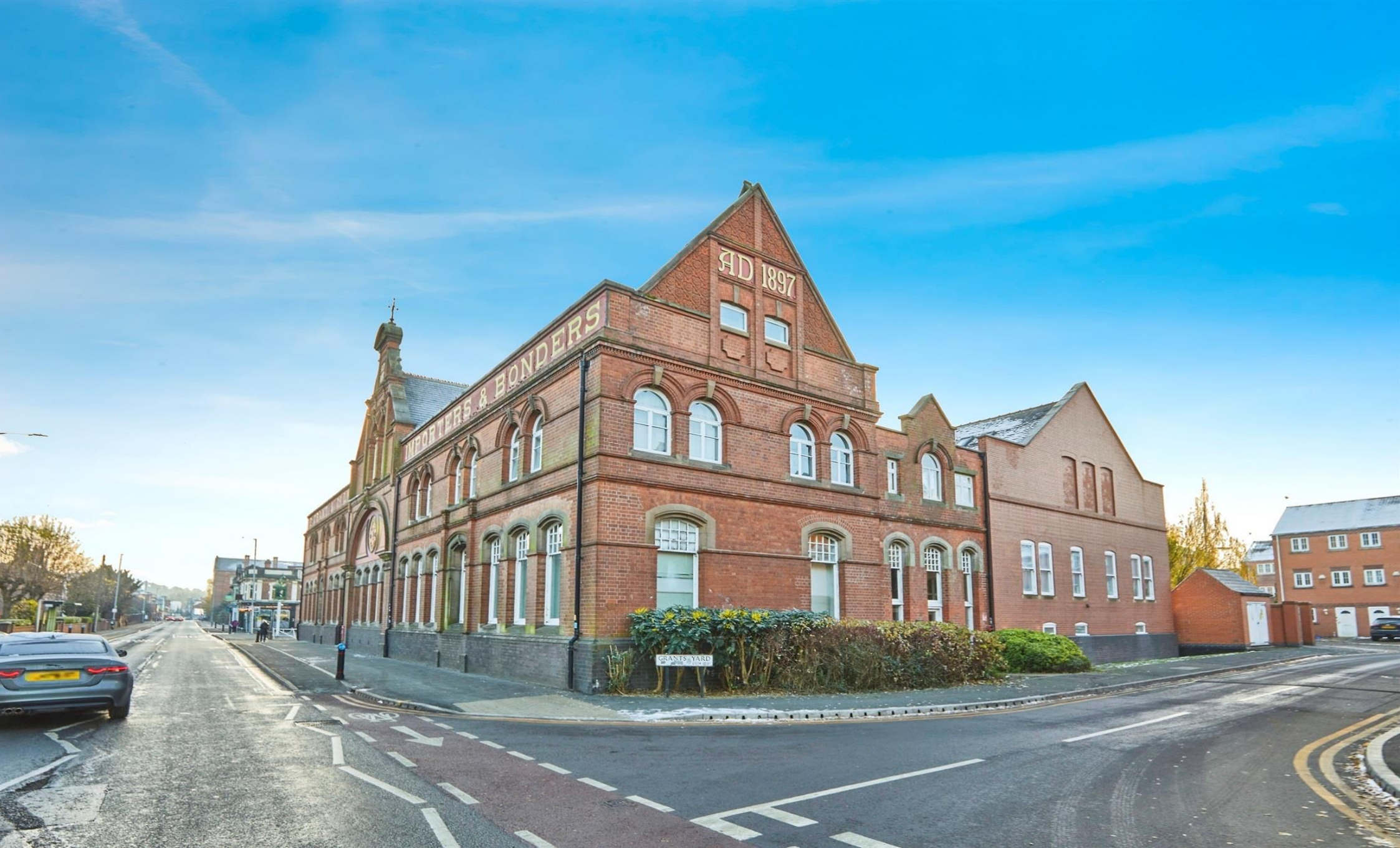
St James' Court Grants Yard Burton-On-Trent