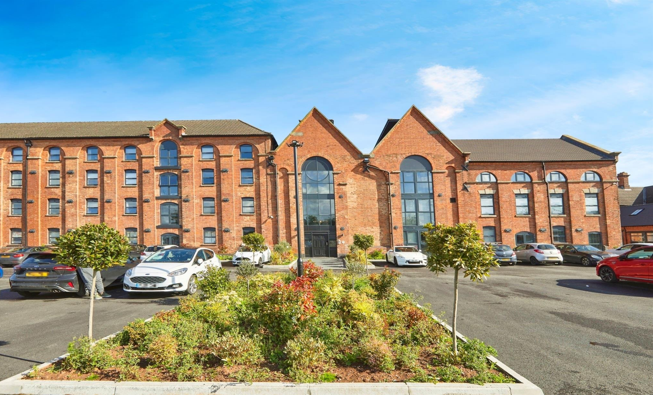
The Maltings, Burton-On-Trent