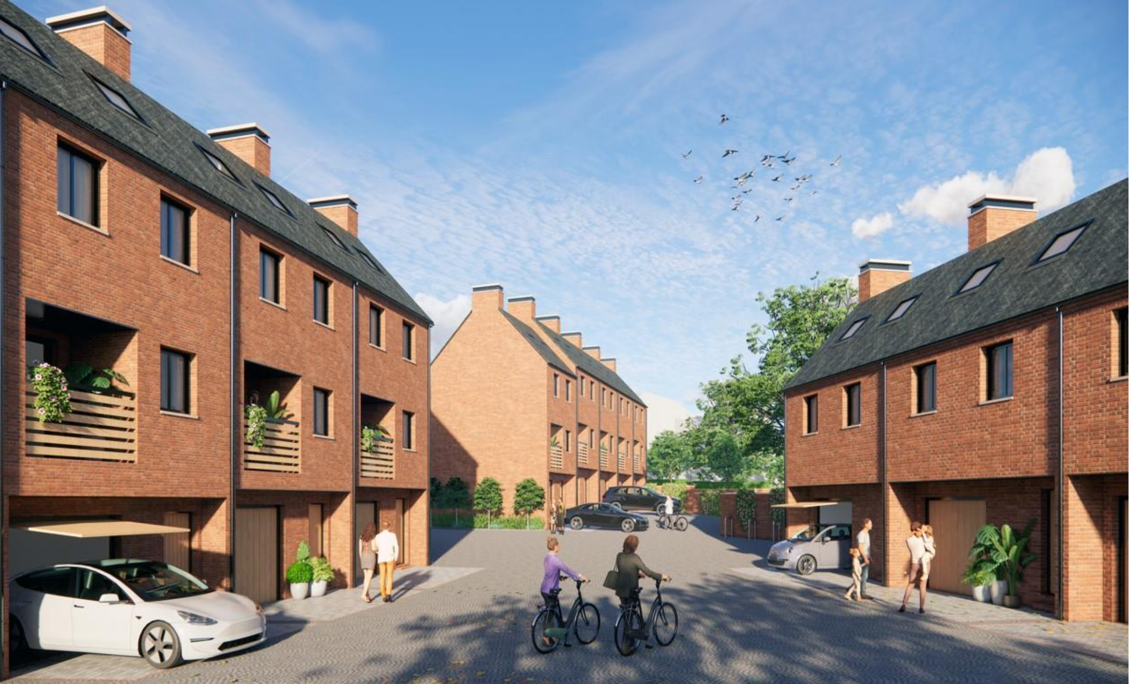
Lander Heights Lander Lane Belper