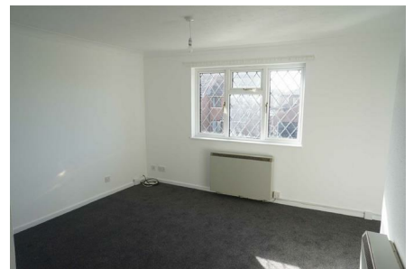
1-Bedroom Maisonette to Let – Boveridge Gardens, Bournemouth, Dorset, BH9 3RF

Discover this bright and well-presented one-bedroom maisonette located in a peaceful residential area of Bournemouth. Perfect for professionals or couples, this charming property offers comfortable living in a sought-after location.