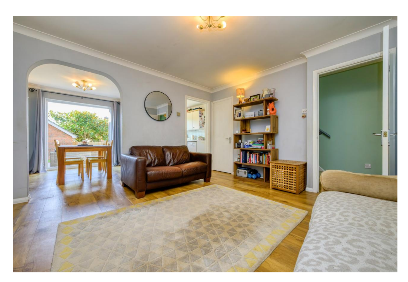
6 Blaenant, Emmer Green, Reading, RG4 8PH Price £500,000 Freehold