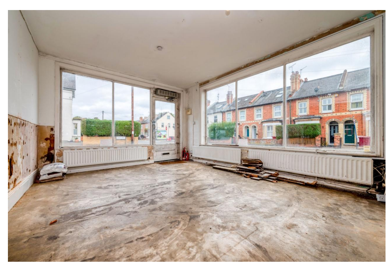
16 Hemdean Road, Caversham, Reading, RG4 7SX Price £525.000 Freehold