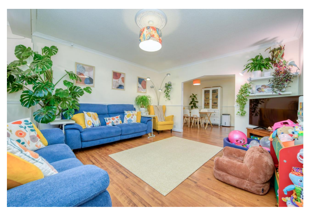
313 Gosbrook Road, Caversham, Reading, RG4 8DY Price £410,000 Freehold