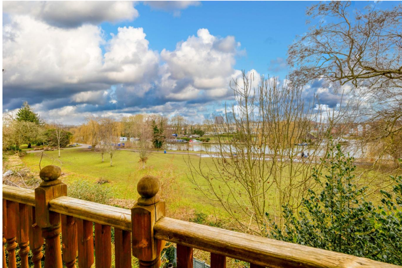
Claydon Court, The Willows, Caversham, Reading, RG4 8BQ Price £230,000 Leasehold

Masons are proud to offer to the market this two bedroom top floor apartment, overlooking The River Thames in the centre of Caversham, close to all local amenities and within walking distance of Reading Town Centre and mainline station. Ideal for investors or first time buyers and currently achieving approximately a 5% yield, the property benefits from an 18ft living/dining room with access to the balcony which overlooks Christchurch Meadows and The River Thames, a 9ft kitchen, a 13ft master bedroom with built in wardrobe, a 10ft second bedroom with built in wardrobe and a family bathroom. Further benefits of the property include a 958 year lease, a peppercorn ground rent and the property is offered for sale with NO ONWARD CHAIN.