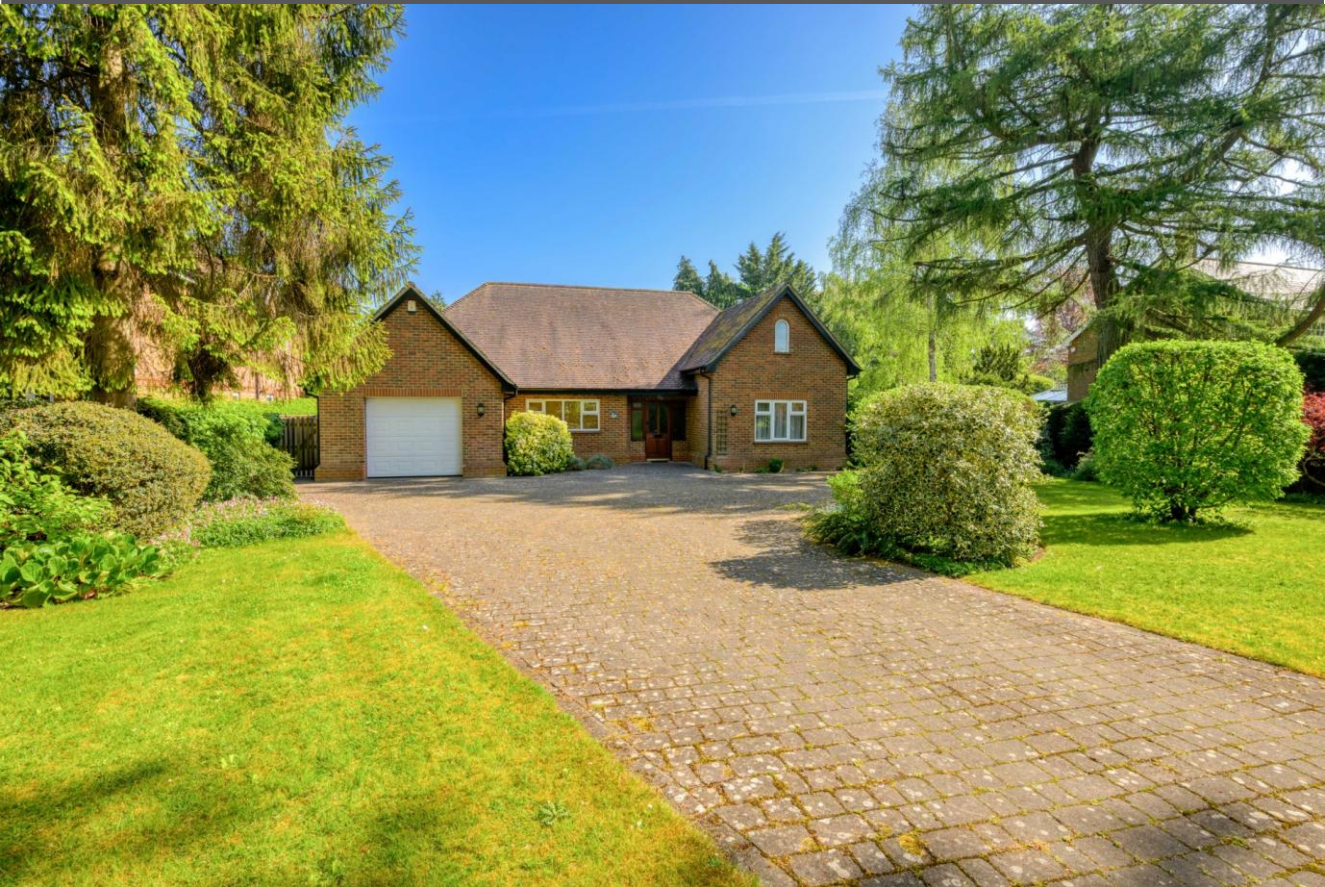
56 St Peter`s Avenue, Caversham Heights, Reading, RG4 7DH Price £1,150,000 Freehold

10 Bridge Street, Caversham, Reading RG4 8AA t 0118 946 1140 e sales@masonsestateagents.com