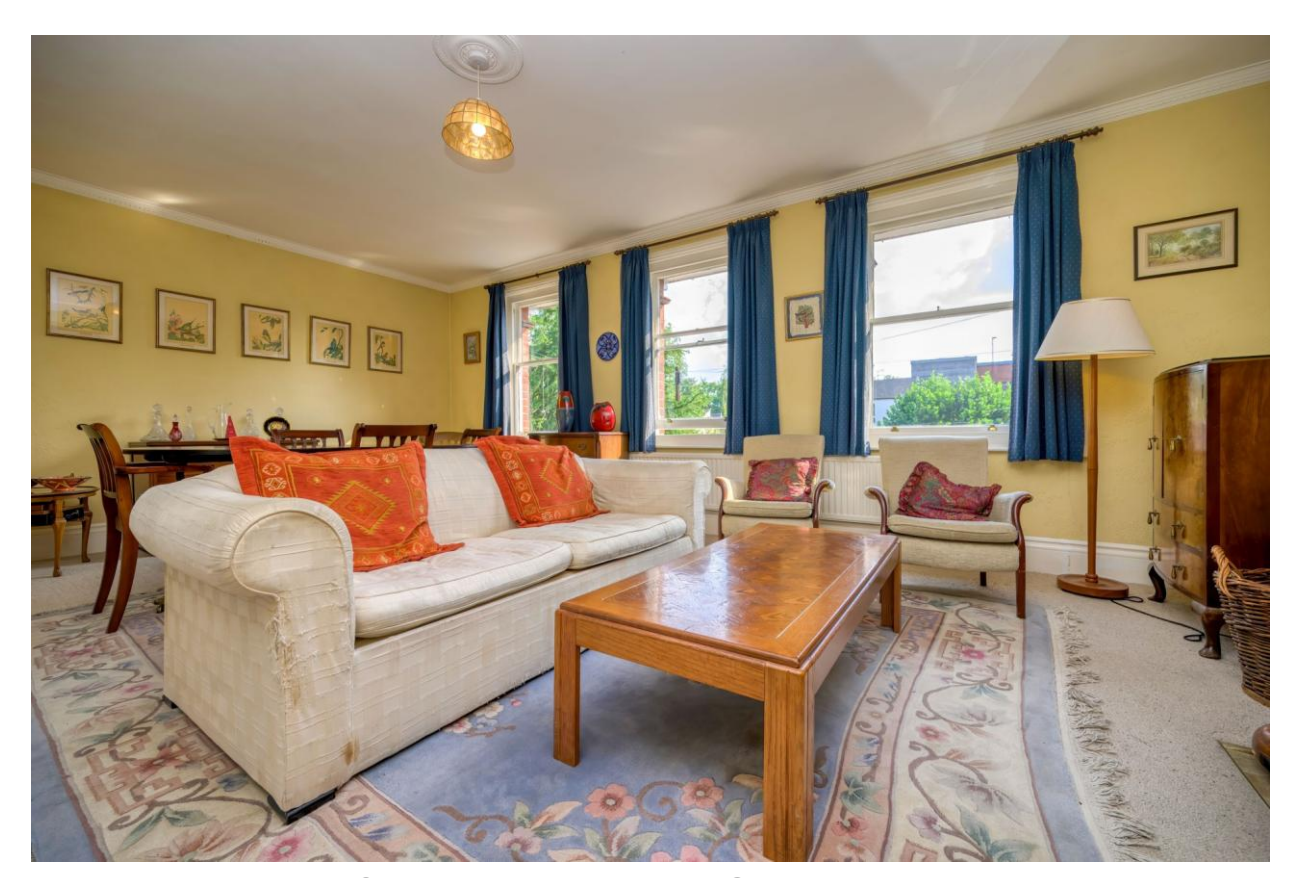
13 Derby Road, Caversham, Reading, RG4 5HE OIEO £400.000 Leasehold with Share of Freehold