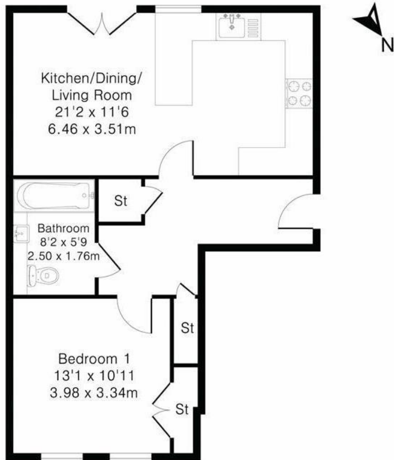
First Floor Flat

Approximate Gross Internal Area 540 sq ft – 50 sq m