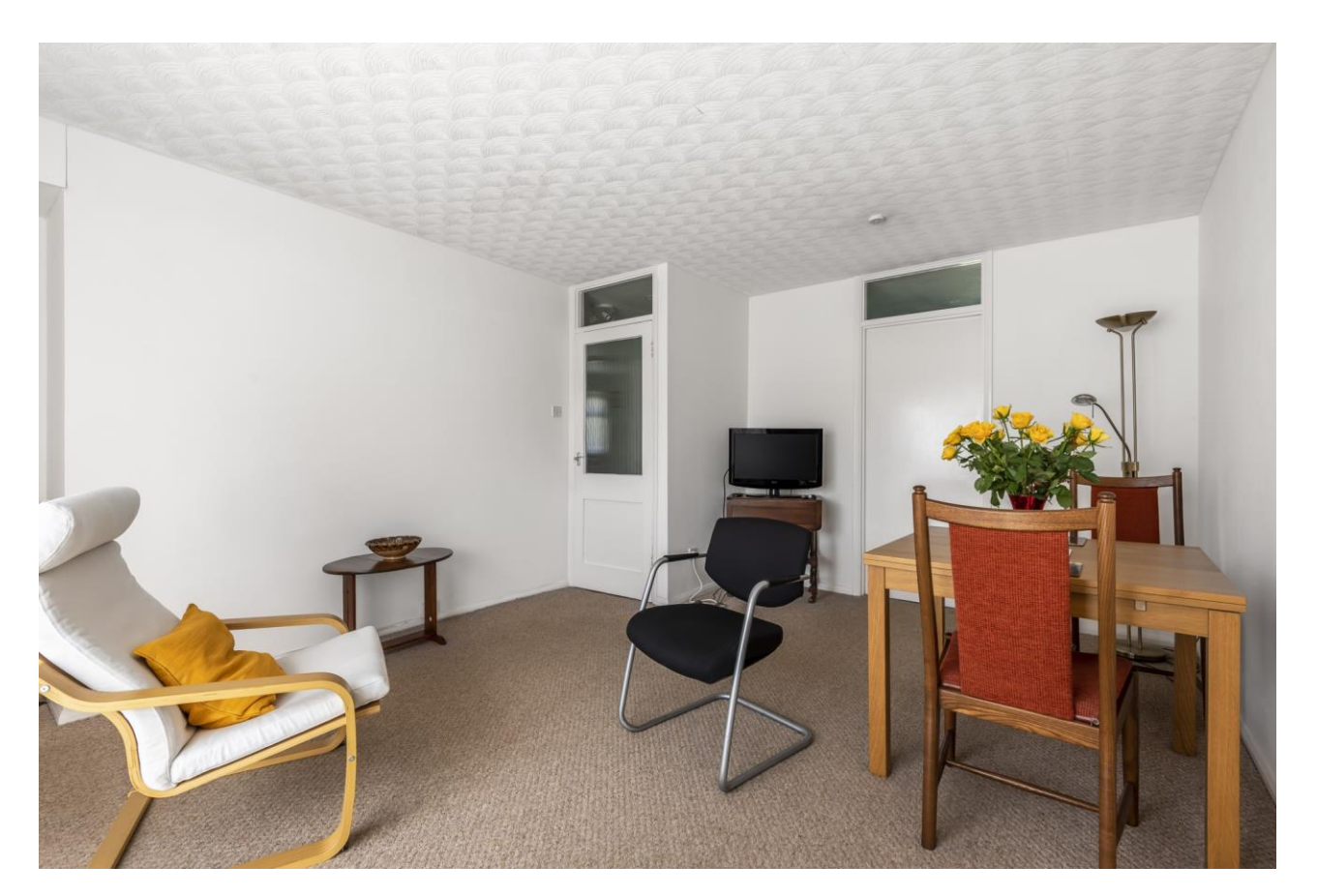
15 Emmer Green Court, Emmer Green, Reading, RG4 6NQ O.I.E.O. £250,000 Leasehold

Masons are proud to offer to the market this two double bedroom ground floor maisonette, with an extended lease offered on completion of the purchase. The property is situated in Emmer Green just a stone's throw away from a parade of shops and local amenities including a post office, supermarket, doctors, bus stop, schools, playing fields and is close to both Caversham & Reading centres along with Reading mainline station. The accommodation comprises of a 15ft living/dining room, a 9ft kitchen, two double bedrooms and a modern family bathroom. Further benefits of the property include an extended lease upon completion, UPVC double glazing, a well maintained garden, a garage in a block and the property is offered for sale with NO ONWARD CHAIN. VIEWING RECOMMENDED.