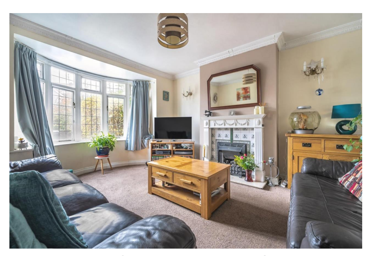
72 Woodcote Road, Caversham Heights, Reading, RG4 7EX Price £575,000 Freehold

Masons are proud to offer to the market this attractive and extended three/four bedroom semi-detached, located on a sought after road Caversham Heights and close to Caversham & Reading centres, along with Reading mainline station. The property is presented in good order throughout and its from a 15ft living room, a 22ft dining room, a 16ft kitchen, a utility room and a 12ft bedroom four/reception three. Further benefits include annex potential, three further bedrooms, a master bedroom with ensuite, an additional bathroom, a large rear garden, garage and off road parking. Viewing recommended.