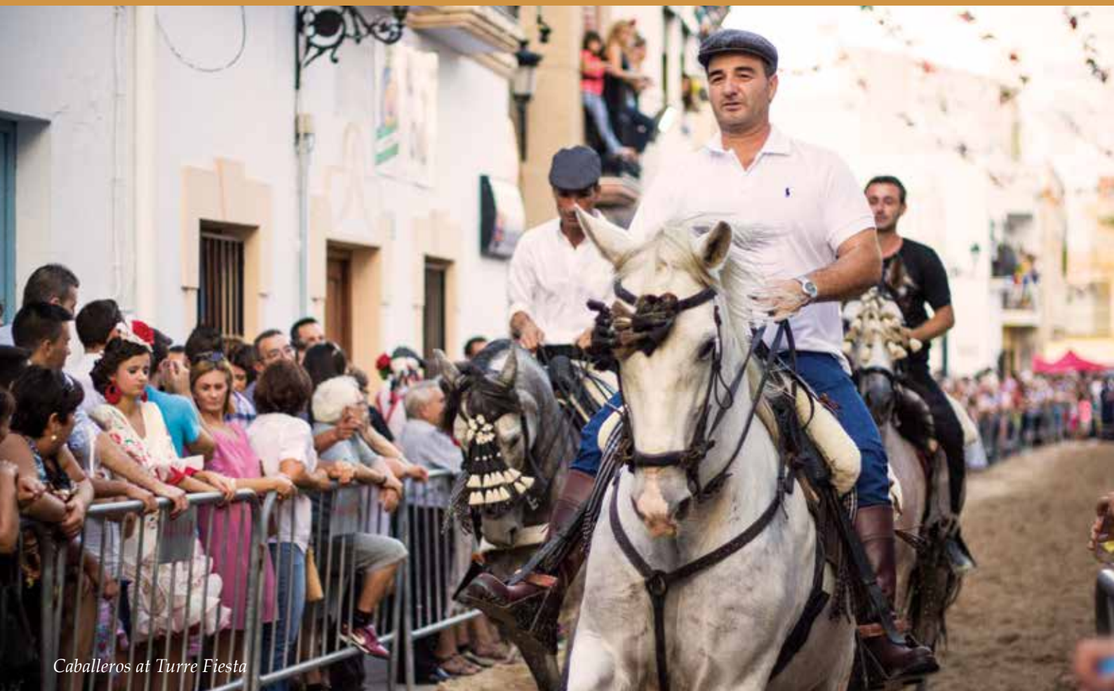
Caballeros at Turre Fiesta

morning. Huércal Overa is well served by the motorway network being 1 km away from the main North-South coastal motorway.