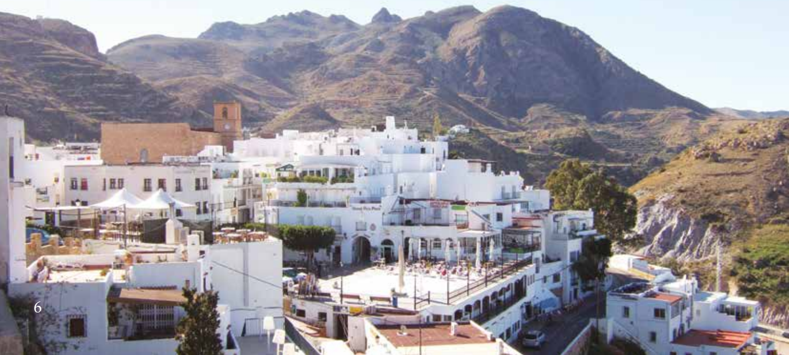
A view from Mojacar Pueblo to the Sierra Cabrera mountains.

2km from the old town of Mojacar Pueblo, at the foot of the hill, you will find Mojacar Playa . Although this has been a popular tourist resort for over 40 year, Mojacar has found a very nice balance between modern tourism and