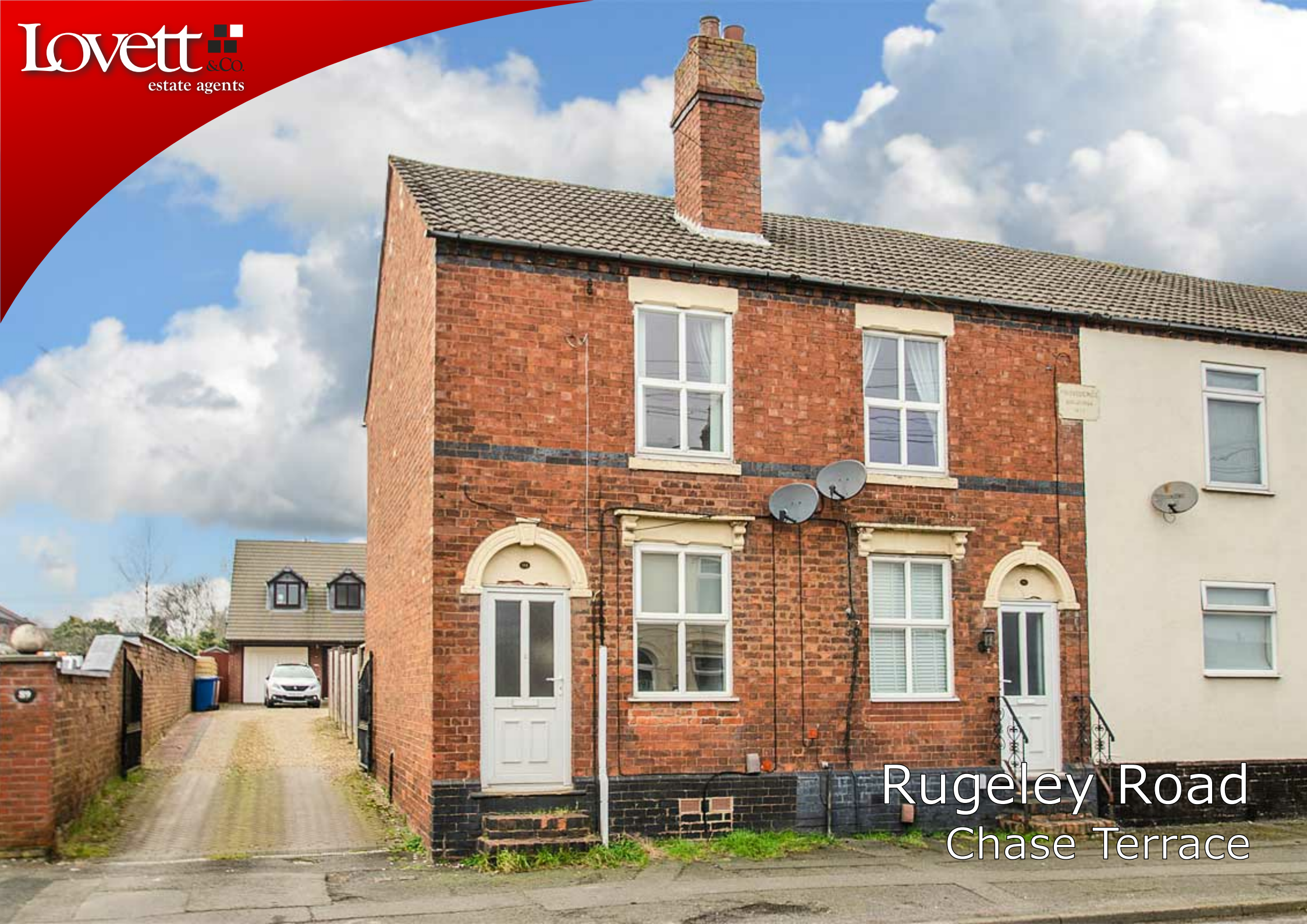
Rugeley Road Chase Terrace