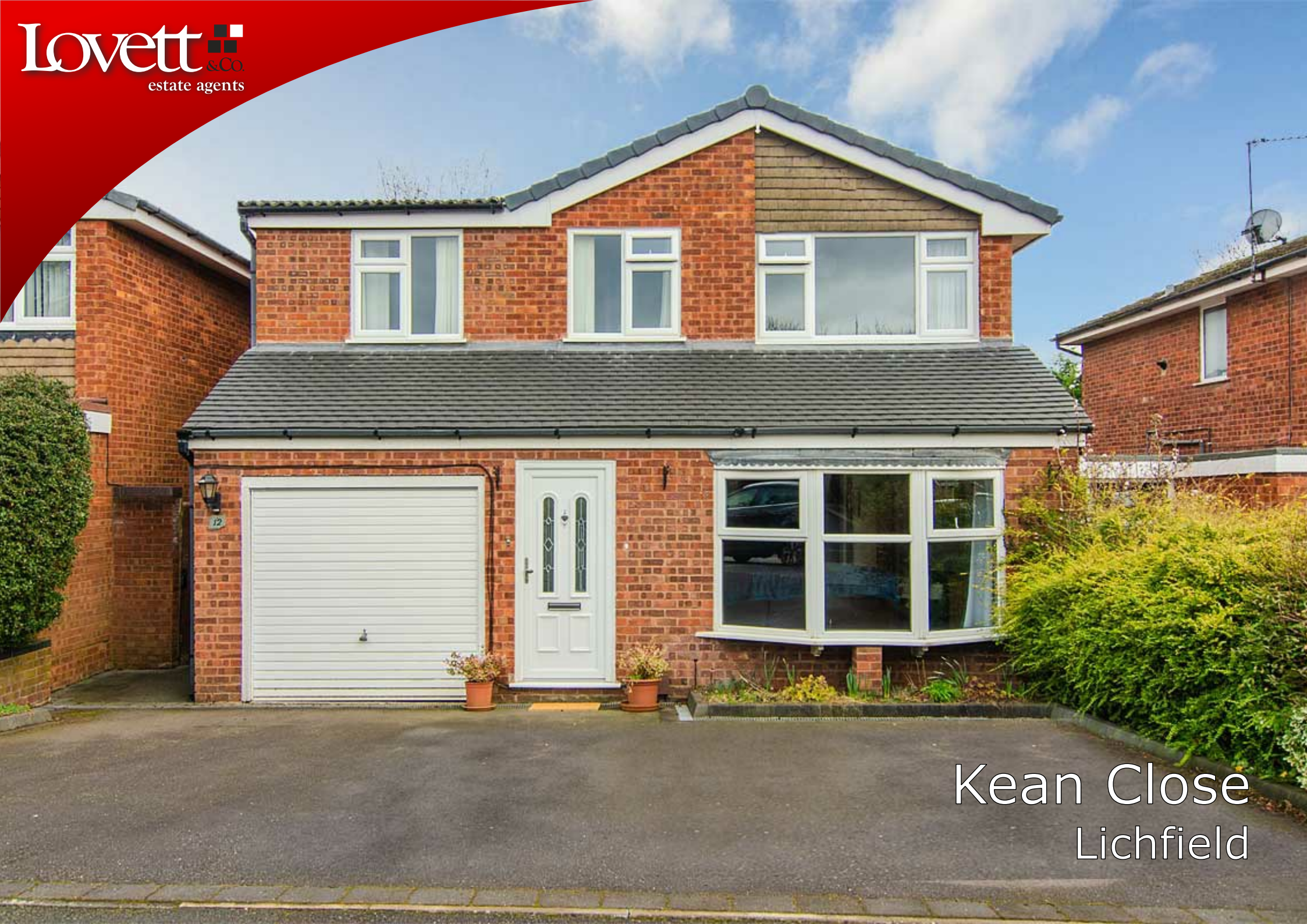
Kean Close Lichfield