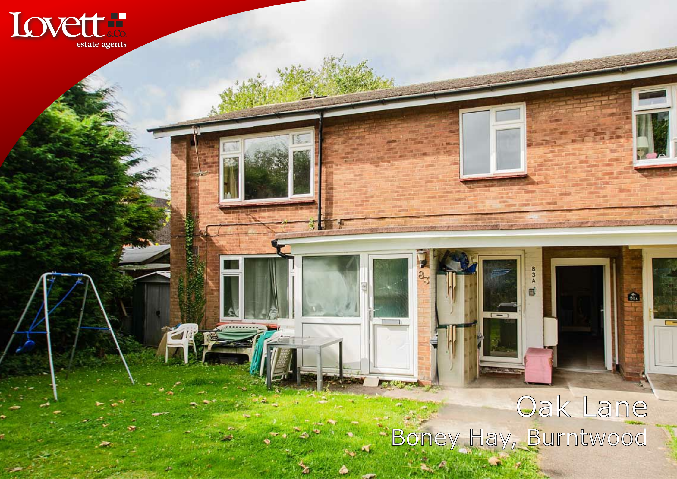
Oak Lane Boney Hay, Burntwood