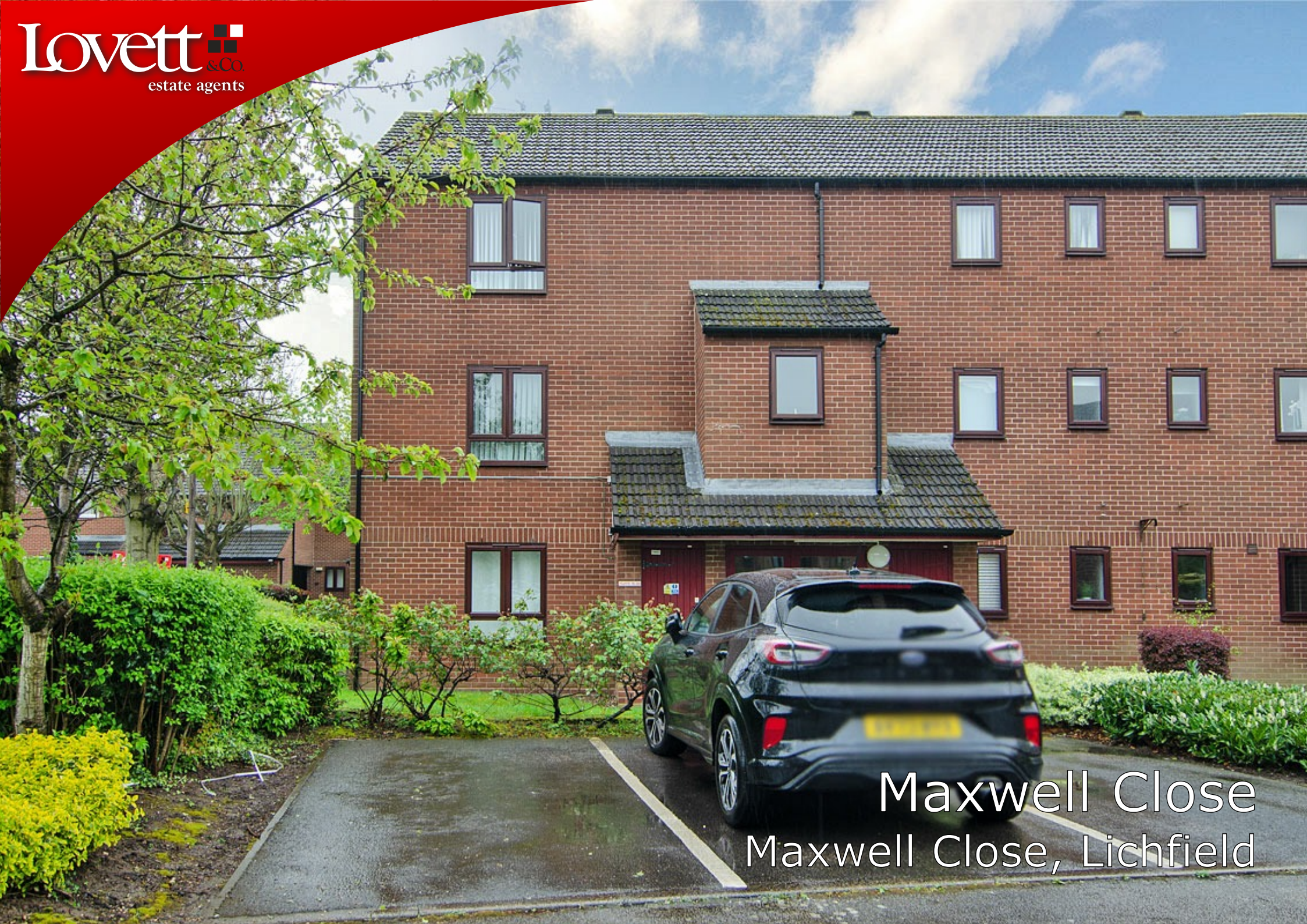
Maxwell Close Maxwell Close, Lichfield