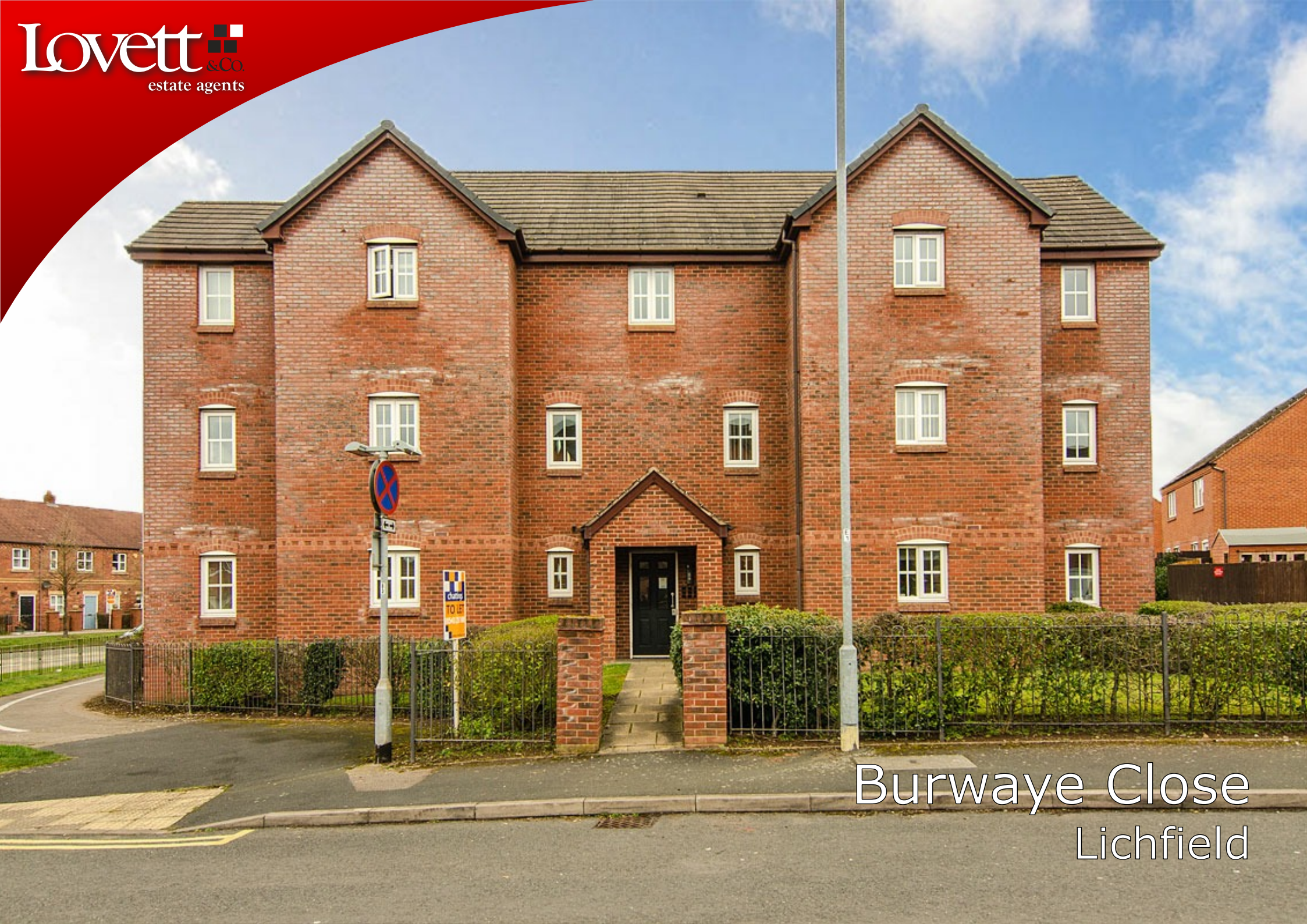
Burwaye Close Lichfield