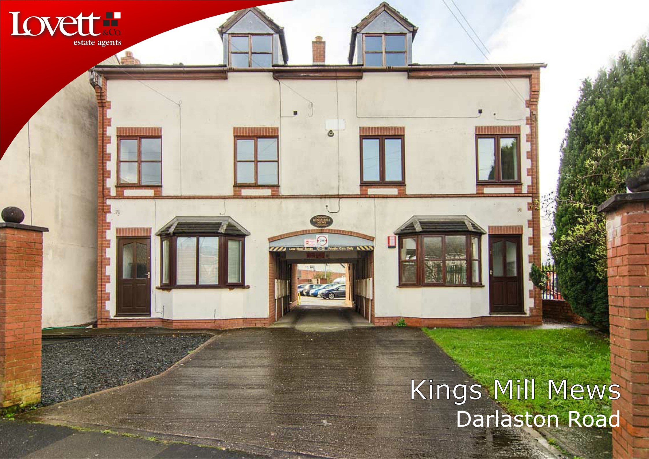
Kings Mill Mews Darlaston Road