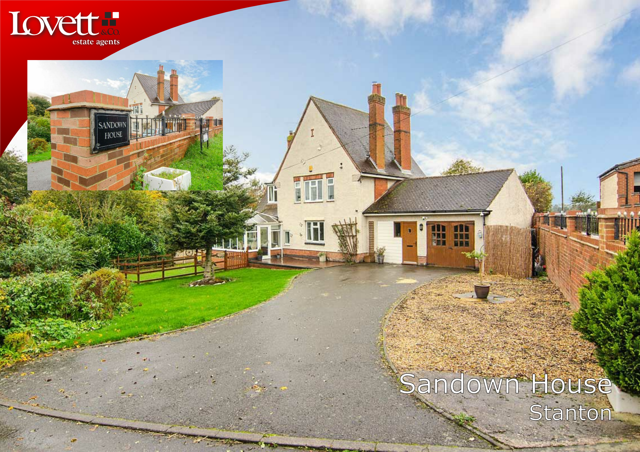
Sandown House Stanton