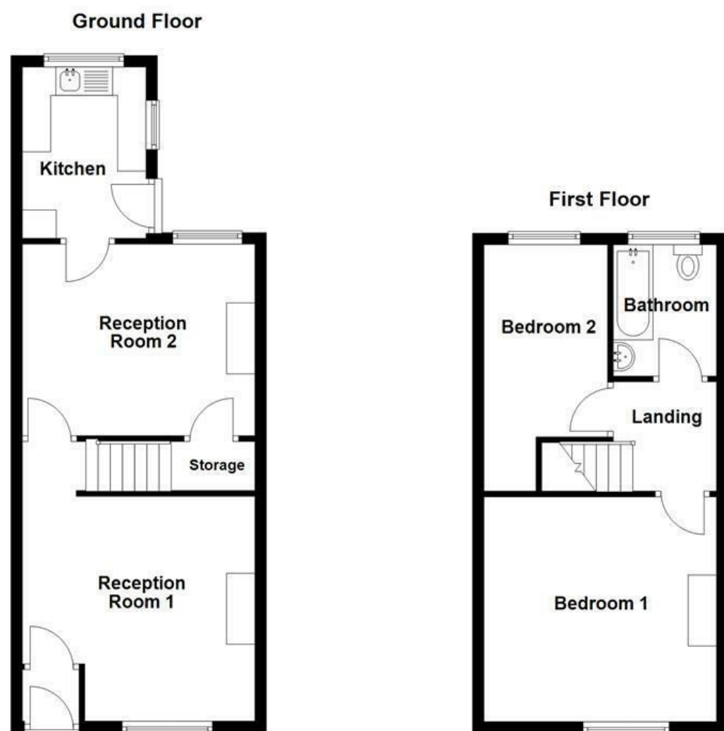
All floorplans are for guidance only. Not to scale. Please check all dimensions and shapes before making any decisions reliant upon them. Plan produced using PlanUp.