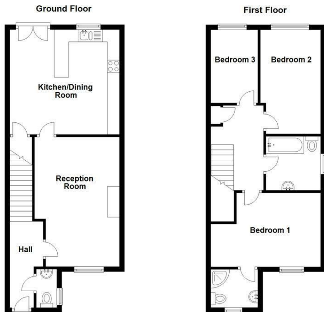
All floorplans are for guidance only. Not to scale. Please check all dimensions and shapes before making any decisions reliant upon them. Plan produced using PlanUp.