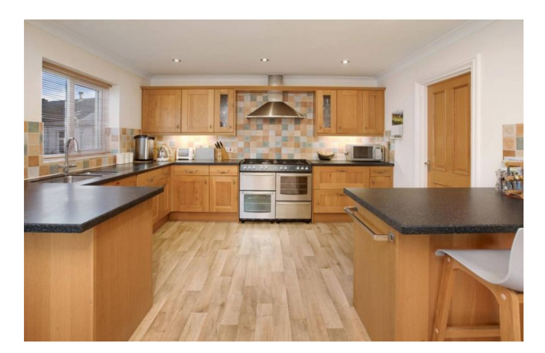
Tenure Freehold Council Tax Band G - £4173.90