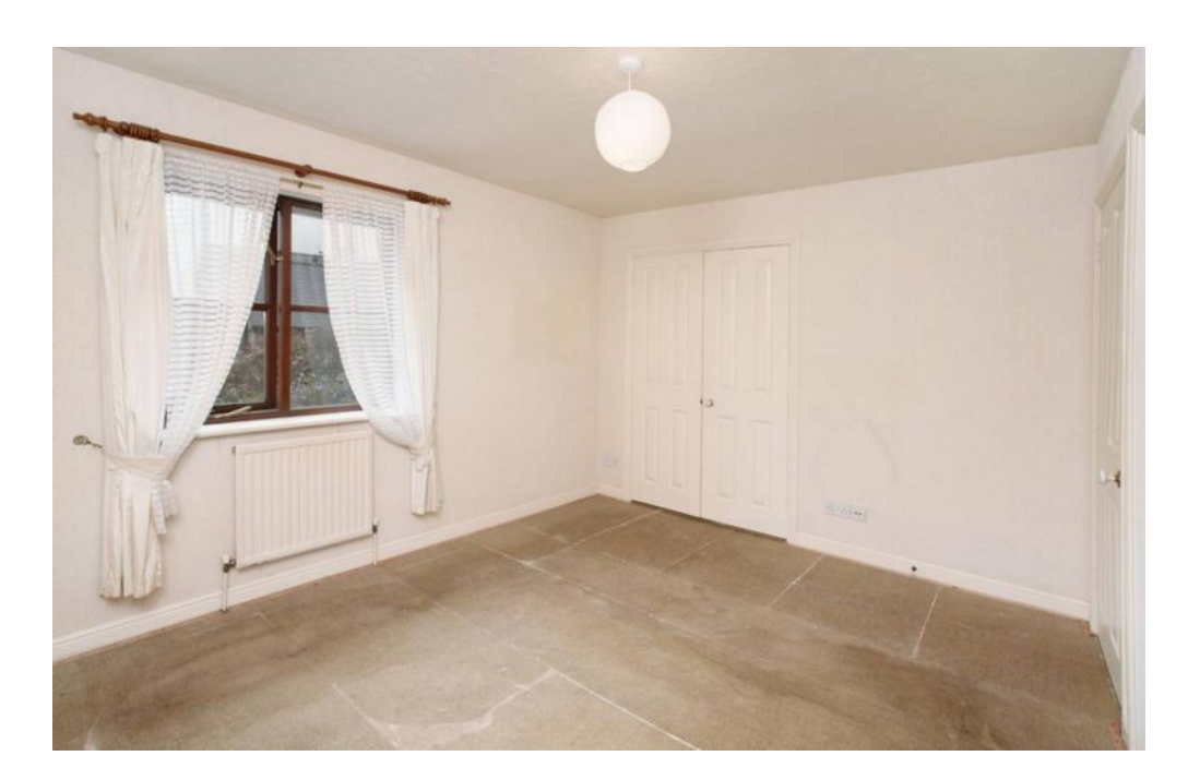
Tenure - Freehold Mains Services - Gas, Electric and Water