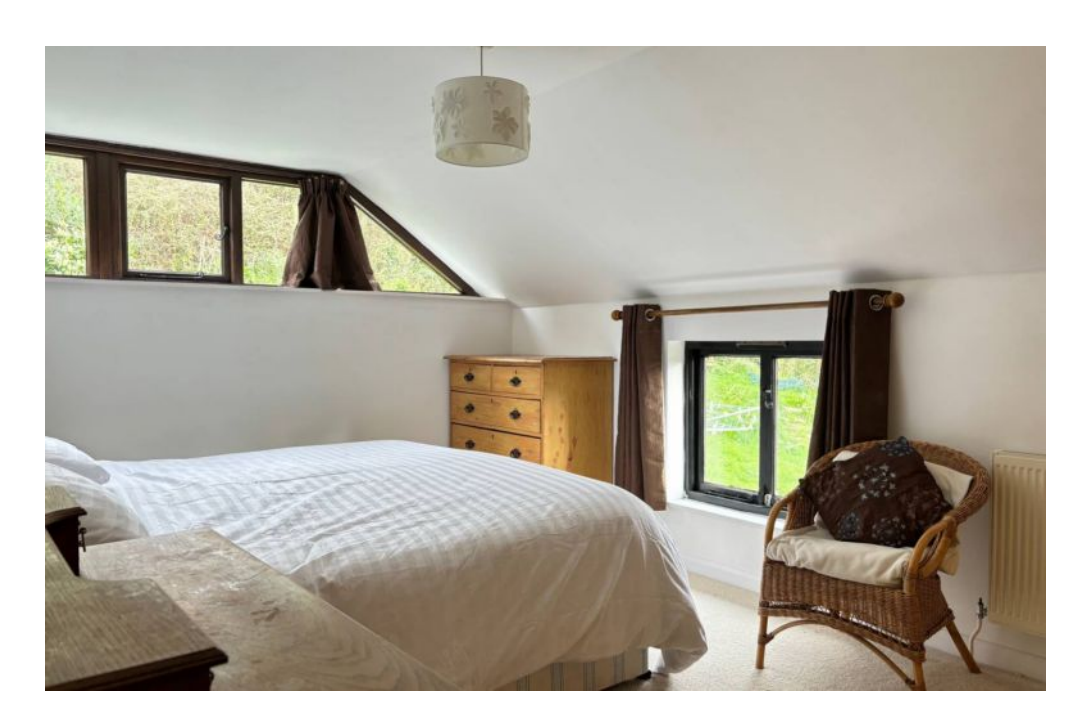
Tenure: Freehold Council Tax Band D - £2587.36 per annum

Mains Services: Electric, Gas and Water all connected.